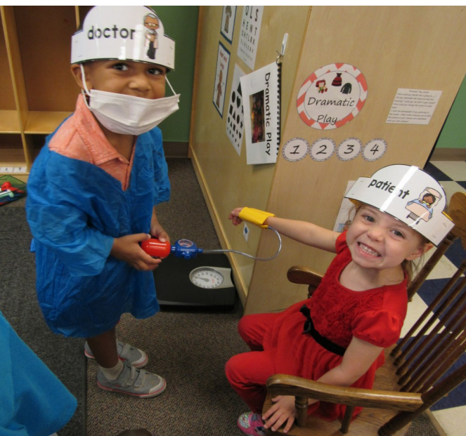
Ellsworth Head Start Parent Handbook

You will be contacted if your child becomes ill at school. You will be required to pick your child up immediately.